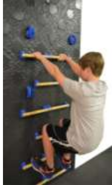
Fitwall Youth Pack