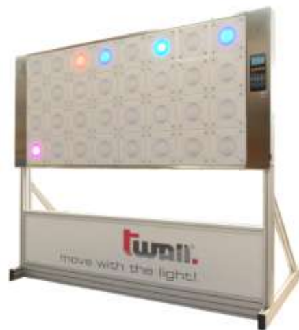
T Wall 32