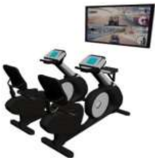
Exerbike Recumbent Station