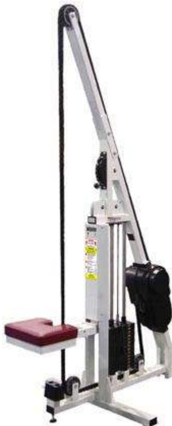
Rope Climber LT