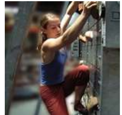
Treadwall M4 Pro