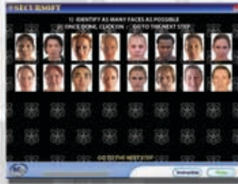
Temporal Order Memory